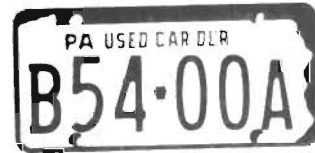
Used Car Dealer