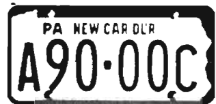
New Car Dealer