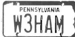
Amateur Radio Operator