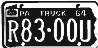
Truck 2 Axles Class R-Z