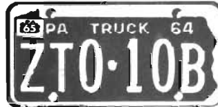
Truck Tractor 3 Axles Class WT-ZT