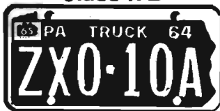
Truck 4 Axles Class YX&ZX