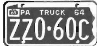
Truck 3 Axles Class UZ-ZZ