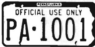
State Official Cars